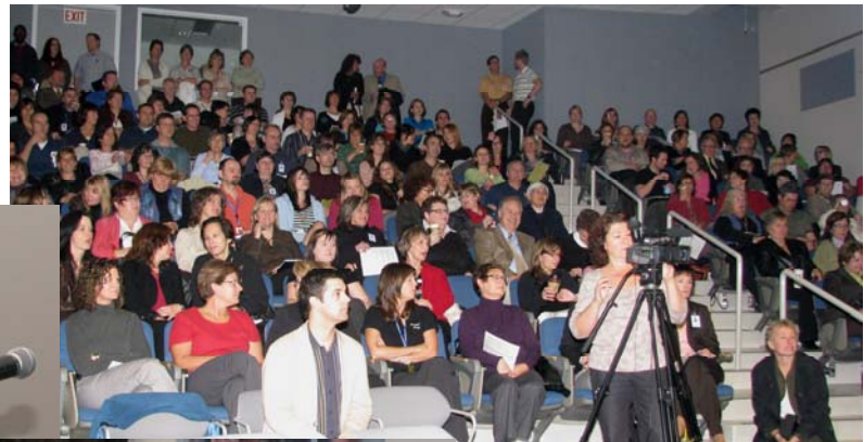
Above: Full house at the SCH Rependa Auditorium. More than 200 employees attended the Our Values in Action launch event